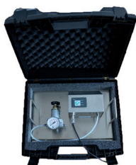
Compressed air quality measurement