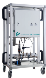
Compressed air quality measurement