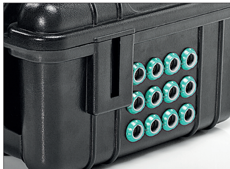
12 sensor inputs