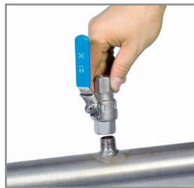
A Screw neck

By means of the drilling jig, it is possible to drill under pressure through the 1/2" ball valve into the existing pipe. The drilling chips are collected in a filter. Then install the probe as described under 1).