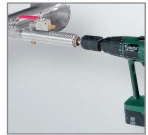
Drill under pressure with the CS drilling jig

3) Due to the large measuring range of the probe even extreme requirements to the consumption measurement (high volume flow in small pipe diameters) can be met.